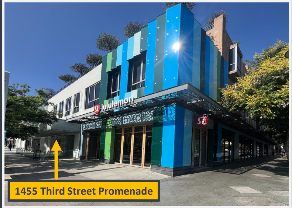
1455 Third Street Promenade